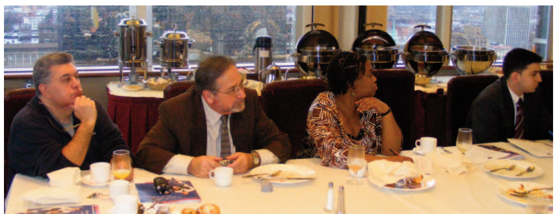
HPAAE members at UMDNJ meet with legislative leaders Senator Joseph Vitale, Senator Ron Rice, Assemblyman Tom Giblin