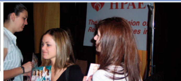
Convention participants collecting HPAE literature