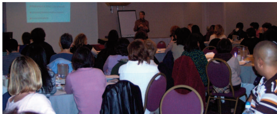
HPAE members attending an Education Workshop on March 19, 2008.

So, political action will always be an integral part of what we, as a union, do on behalf of our members, our families, and our patients.