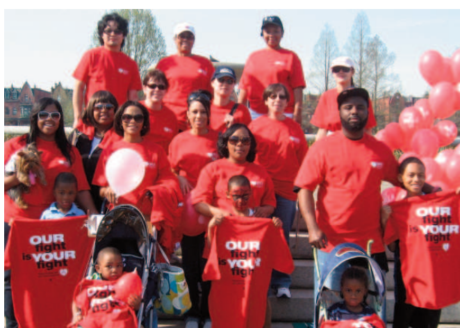
Local 5103 members turned out in large numbers at a Red Cross walk-a-thon to gain public support